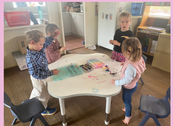
Fine Motor Skills